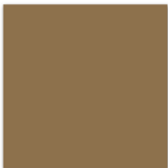
Gold / Oro REF: 62016