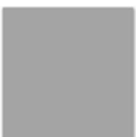
Grey/ Gris REF: 62018