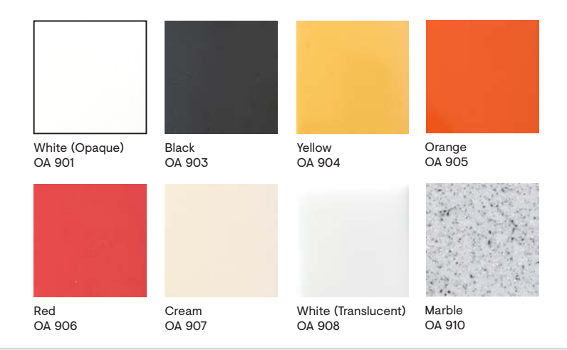
Interior panels HPL and LPL

Customer specified material also available