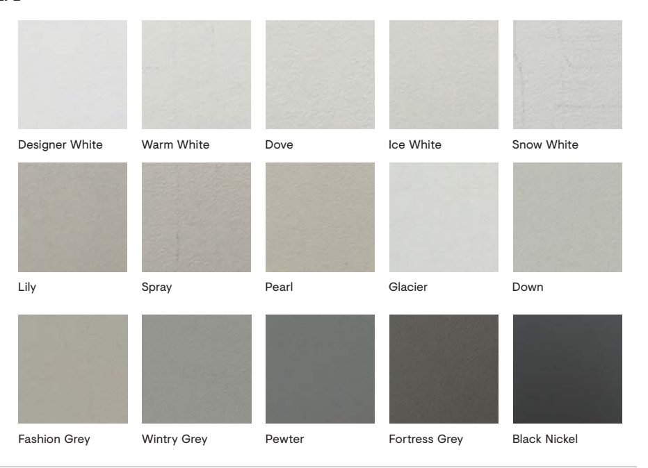
Customer specified material also available