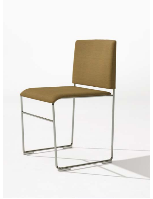
1 Art. 6602