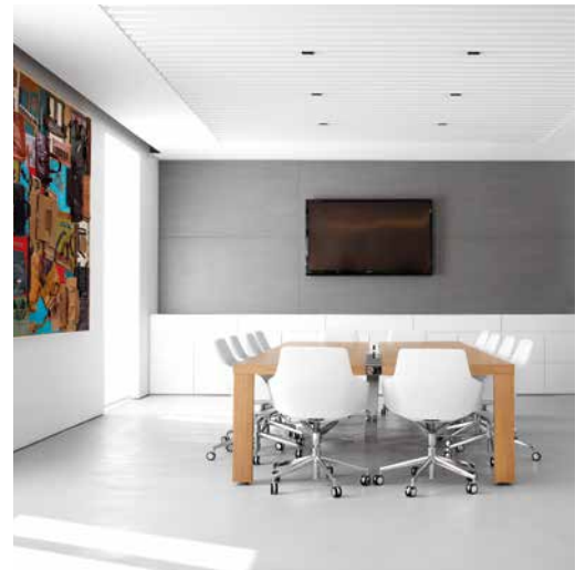
3 Orona IDeO, San Sebastián, Spain Art. 1927 Office